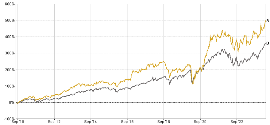
■ A - VT - De Lisle America B USD in US [500.86%] ■ B - IA North America TR in US [361.34%]

06/08/2010 - 29/03/2024 Data from FE fundinfo2024